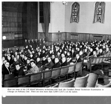
CDT Magazine from March 1964 with photo of examination candidates.